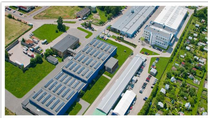
Figure 1 The view of KAN Sp. z o.o. manufacturing plant located in Kleosin

KAN Group, headquartered in Kleosin (Poland), is an experienced European manufacturer and supplier of KAN-therm installation systems. Since opening its business activity in 1990, KAN has built its position on strong pillars: professionalism, innovativeness, quality and development. KAN-therm is an optimal, complete installation multisystem which comprises the most modern, complementing